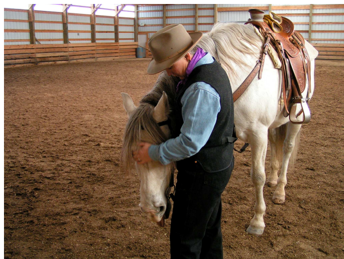
Mutual Respect with a willingness to yield!

will give you some good ground school exercises to use for helping you to provide good leadership. (Click within "Articles" for NWHS Clinic #1.)