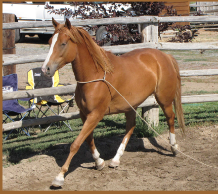
More Colt Starting Action!!