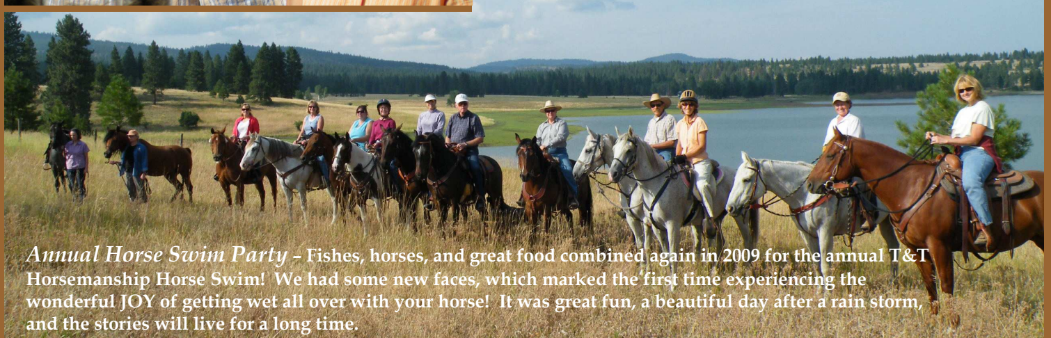
Annual Horse Swim Party - Fishes, horses, and great food combined again in 2009 for the annual T&T Horsemanship Horse Swim! We had some new faces, which marked the first time experiencing the wonderful JOY of getting wet all over with your horse! It was great fun, a beautiful day after a rain storm, and the stories will live for a long time.